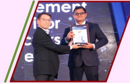
2 nd Prize in Toyota 10 th National Seminar in SA T-TEP Category