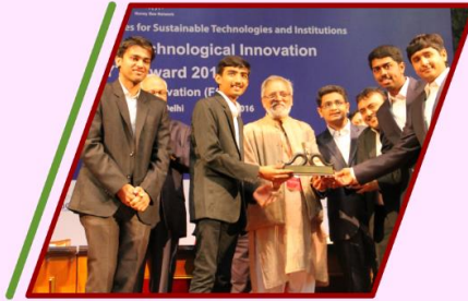
Gandhian Young Technological Innovation (GYTI) Award 2016