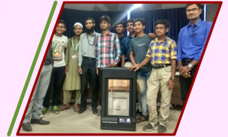
CIC3 Awards for Faculties & Students