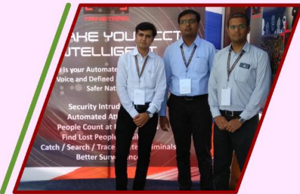
2 nd Prize in India Hackathon in 2018