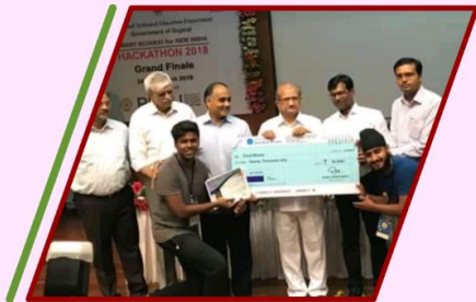
1 st Prize in Gujarat Hackathon in 2018