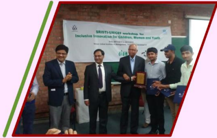
SRISHTI UNICEF 2015