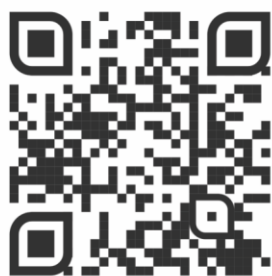
LIC Golden Jubilee Scholarship