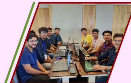
Won 2 nd Prize in SSIP Gujarat Hackathon 2023