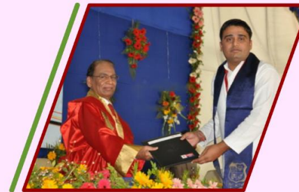
Gold Medal of Faculty in Gujarat Technological University