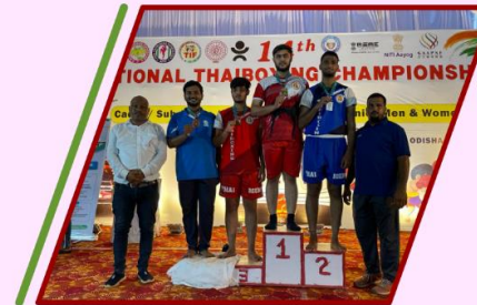
Gold Medal at National Thai Boxing Championship