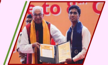
Gold Medal of Student in Gujarat Technological University