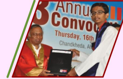
Gold Medal of Student in Gujarat Technological University