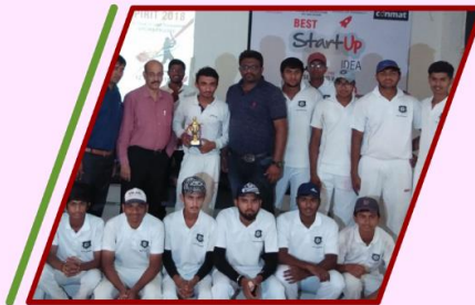
Winner GTU Inter-College Cricket 2018 Ahmedabad Zone