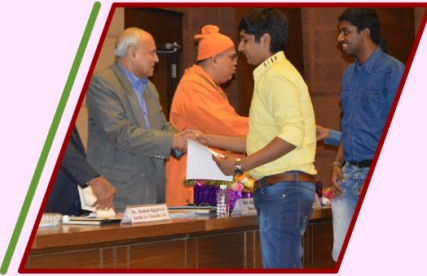
GTU Innovation Award 2015