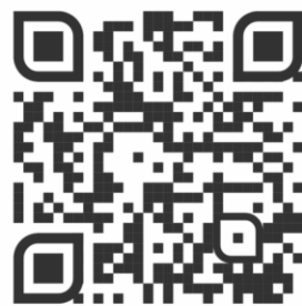
National Scholarship For Minority