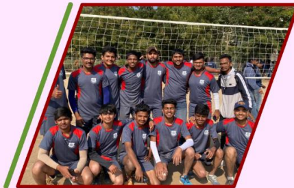
Winner GTU Inter-Zonal Volleyball Tournament 2020