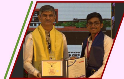
Gold Medal of Student in Gujarat Technological University