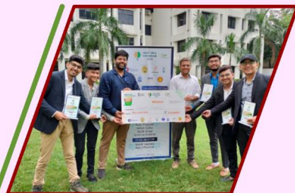
Won 1 st Prize in Smart India Hackathon 2022 among all UG & PG Teams