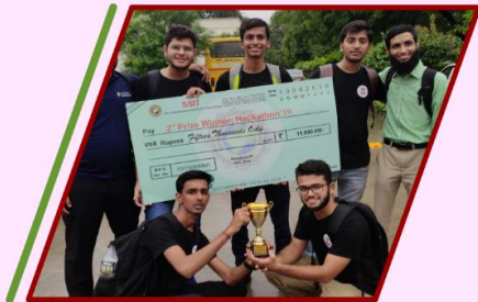
2 nd Prize in GTU Hackathon 2019