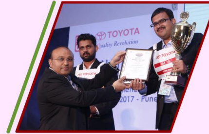
1 st Prize in Toyota 9 th National Seminar in SA T-TEP Category