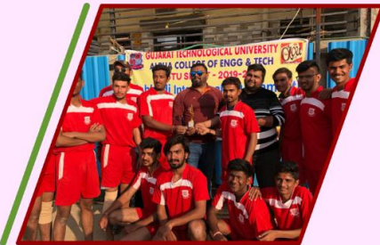
Winner GTU Inter-Zonal Kabaddi Tournament 2020