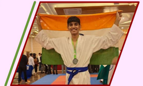
Bronze Medal at Indo-Nepal International Karate Championship