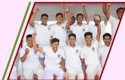
Winner GTU Inter-College Cricket 2022 Ahmedabad Zone