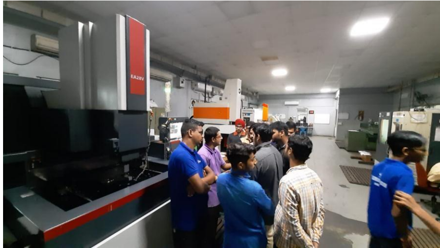
Fig : EDM & its working