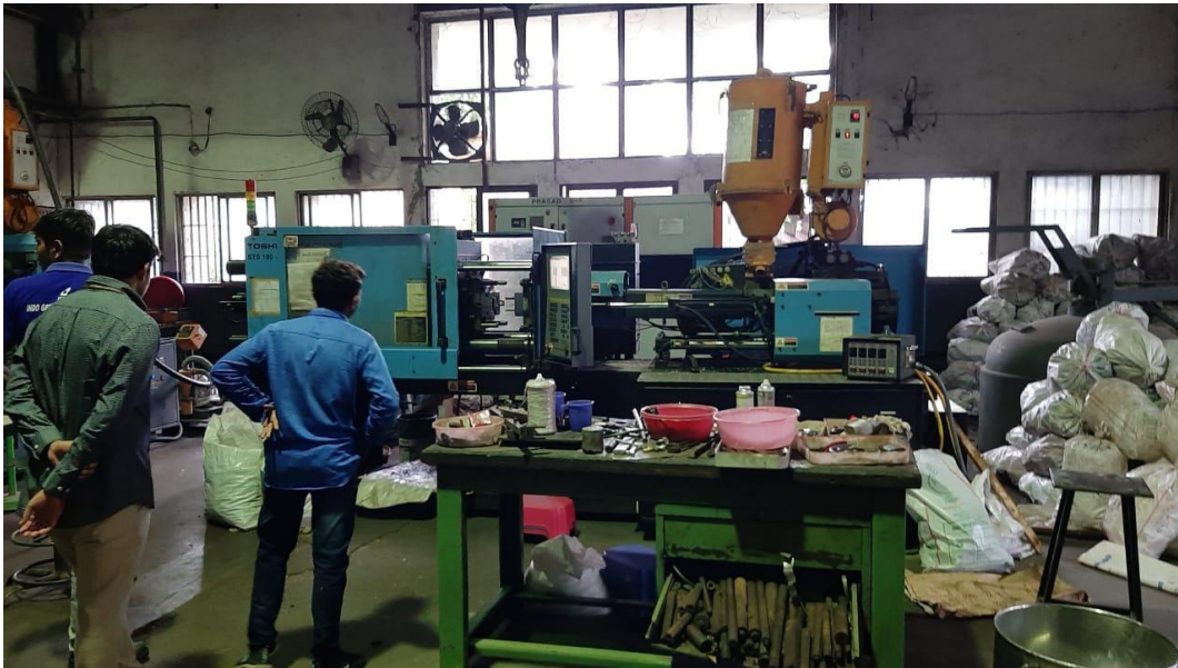
Fig: Injection Moulding machine

This machine is used to produce various products of plastic material such as bucket, plastic cane as per the requirement of the different companies such as Amul. In this process, Mould is first prepared by metal and then moulten platic or resins are poured in to hopper. Then after, hydraulic pressure is actuated, which produces components as per the mould design.