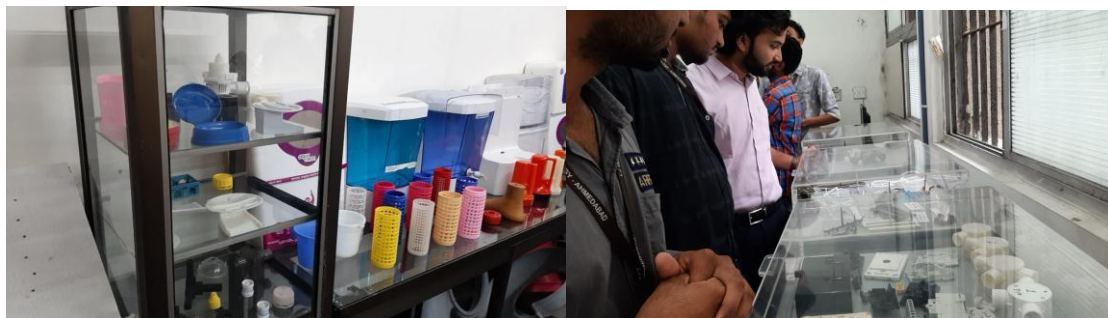
Fig : Various Products of IGTR