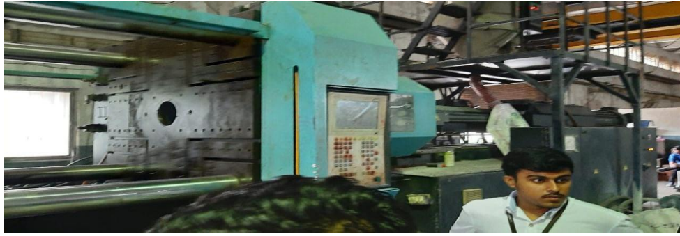
Fig :- Side view of Injection moulding machine with hopper