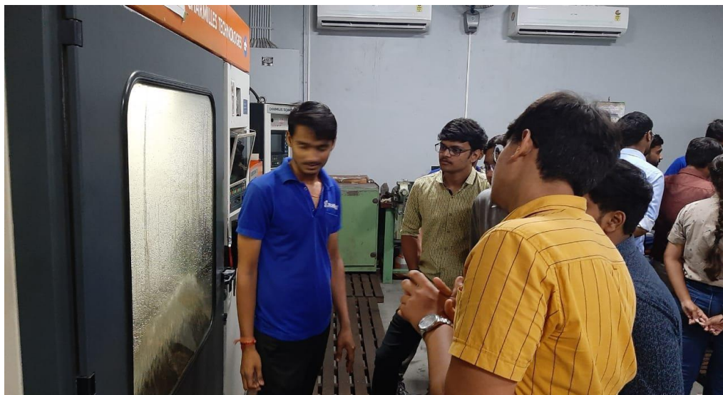
Fig : Working of CNC & UMC machines