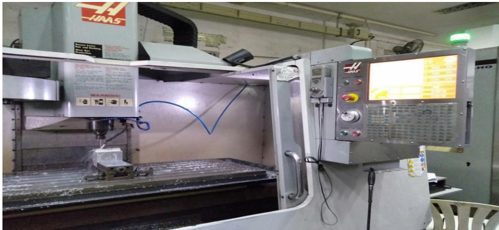
Fig : working of VMC machine

This technology is used to reduce human efforts and improve efficiency of the machining processes. IGTR is using this technology to produce various parts for ISRO and many other organisations. Computerized numerically controlled systems are using various tool axis such as vertical, Universal 3-Axis (X, Y, Z), 5 axis (X, Y, Z, U, V) and 7- axis machines.