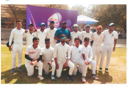
nljcc.official Congratulation team new I j for becoming state champion in "Redbull Cup 2021".