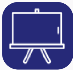
Chalk & Talk Lectures

The Pedagogy has been designed to generate the Output of the Integrated B.Com/ BBA/ BCA in terms of right theory knowledge, Aptitude, Skills and Perspectives in the future professionals.