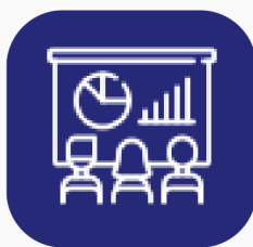
Learning via Digital Experience