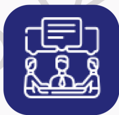
Interactive Activities with Experts