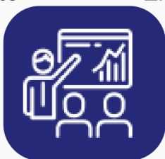
Learning through Presentation & Viva